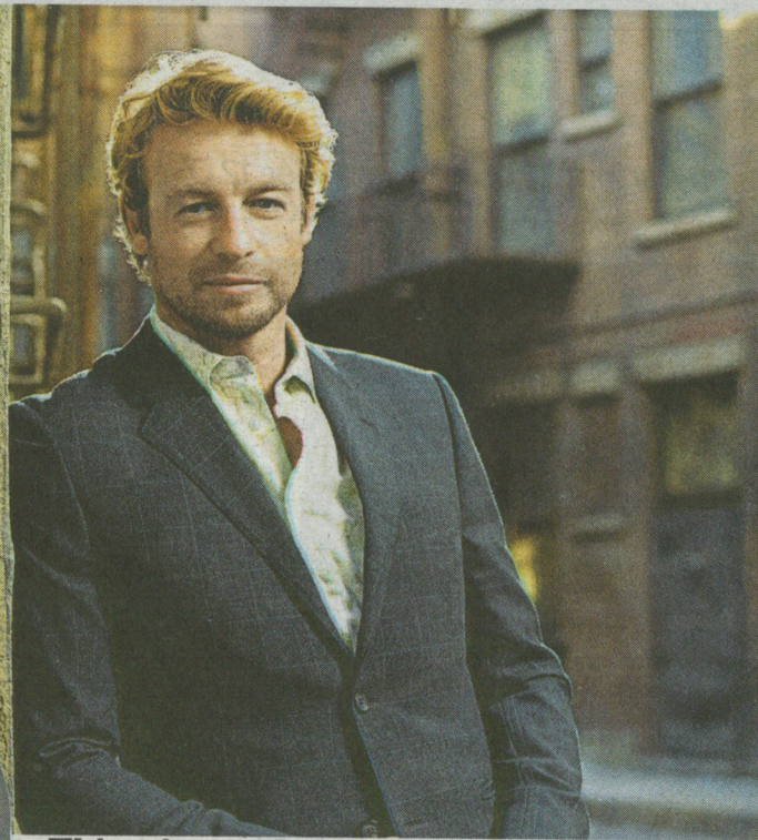
TV show characters Dr Cal Lightman (left) from Lie to Me and Patrick Jane from The Mentalist can see through porkies.

had the opportunity to watch and listen to the witnesses. Trial judges directing juries still give them unqualified encouragement to rely on everyday experience in deciding who to believe. It seems that through ordinary life experience, each of us has become a Patrick Jane without realising it.